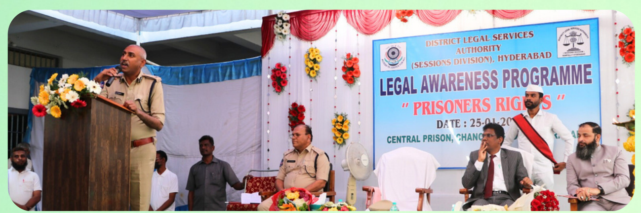
Sri.Y.Rajesh, IG of Prisons, addressing the prisoners during a Legal Aid Awareness program conducted at Central Prison Hyderabad.